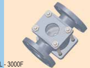
MODEL - 3000F

For pipe sizes 1/2" thru 10" in lines with vertical downward flow. Drip type indicators are particularly suited to distillation or similar apparatus with intermittent flow