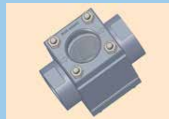
MODEL - 2000S

Recommended for both horizontal and upwards vertical flow. Style 2000-S is best suited to transparent or slightly opaque solutions. It is frequently used for gases and can be supplied without a flapper if no internal indicator is required. In standard units the position of the hinged flap indicates variation in flow rate.