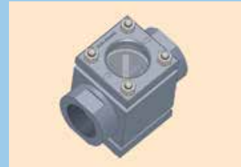
MODEL - 1000S

Recommended for any flow direction, Style 1000S rotary type indicator is best suited to lines carrying dark solutions where rotor motion is easily detected. It can be used with transparent solutions and gases and is ideal where observation must be at a distance.