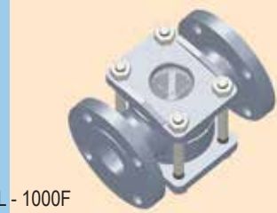
MODEL - 1000F

For pipe size 1" thru 6" with any flow direction. Best suited to lines motion is easily detected. It can be used with transparent solutions observations must be made at a distance.