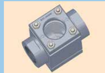
MODEL - 3000S

Recommended for downward vertical flow. Style 3000S is particularly suited to distillation and similar apparatus with intermittent flow. Drip type indicator do not obstruct flow in any way and many also be used for horizontal flow.