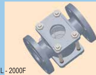
MODEL - 2000F

For pipe sizes 1/2" thru 12" in horizontal lines or vertical lines with upward flow. Style 2000F is best suited to transparent or slightly opaque solutions and may be used for gases. Variation in flow rates is indicated by position of the flapper. All sizes are supplied without flapper on order. 14" and 16" sizes are available without flapper only.