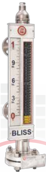
Magnetic Level Gauge