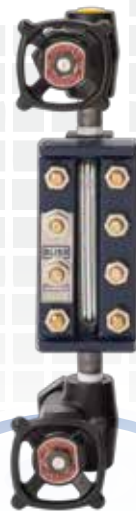
Armoured Sight Glass