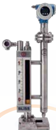
Bridle Radar Transmitter